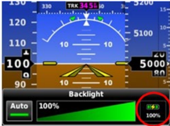
Valid Battery Indication