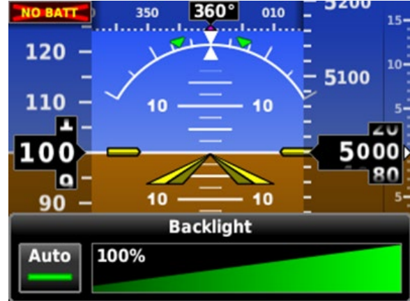
No Battery Detected