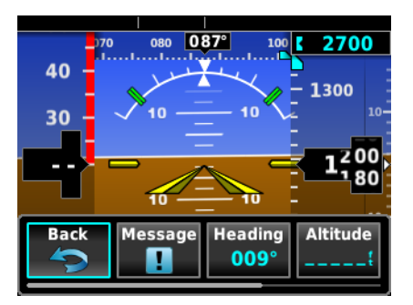
(For Reference Only)